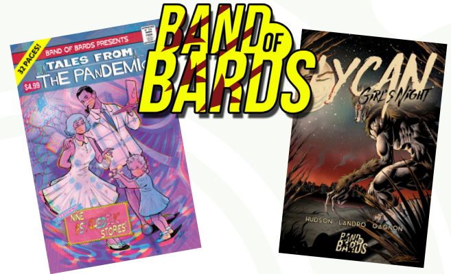
Comic book covers produced by Band of Bards