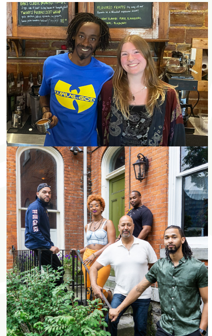
Member-owners of The Healing Grounds Co-op Cafe (top) and Mondragon Village Association (bottom)